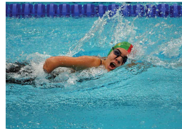
Red Cross Swim Lessons